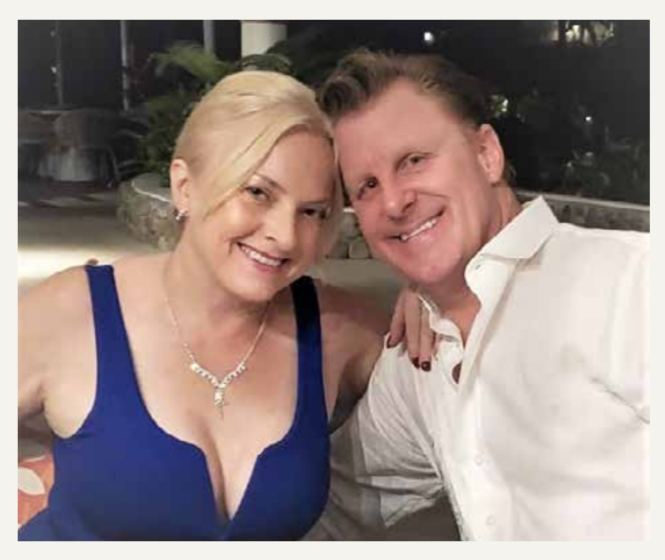
Our 2 Year Anniversary celebration dinner at the Sofitel Fiji Resort & Spa on Denarau Island. (where we spent the first two days of our honeymoon in Feb 2019)