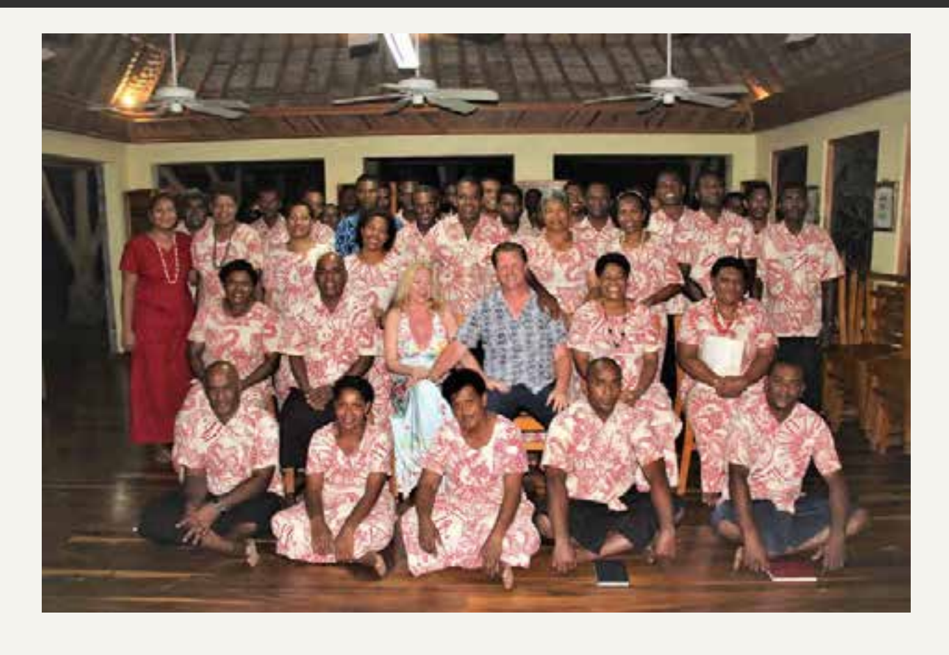
Our incredible honeymoon on Turtle Island with wonderful and talented local Fijian staff.